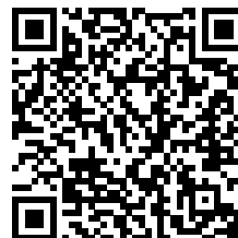
WeShare online giving